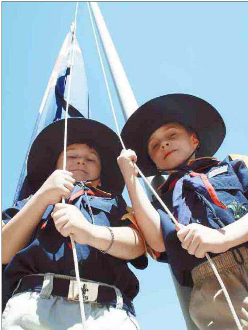
Above: Volunteers wanted... Joey Scouts practice raising the flag ahead of upcoming ANZAC Day celebrations. See page 11